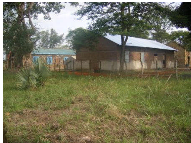
Figure 2 Nehemiah Field Clinic