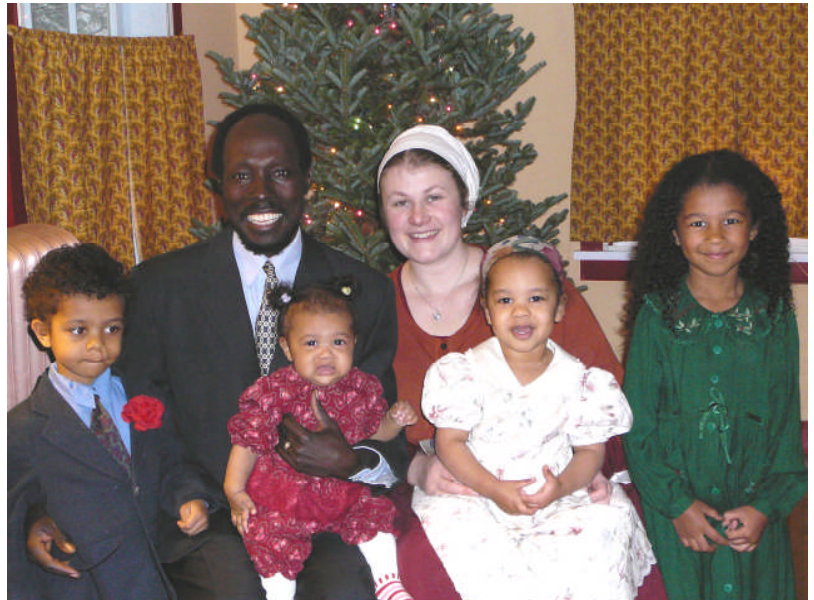
Figure 6 the Levites;