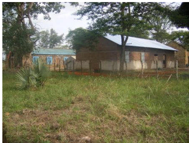
Figure 2 Nehemiah Field Clinic