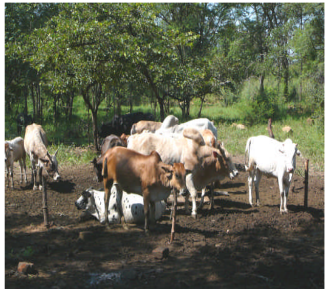
Figure 4 Nehemiah cattle range

The Agricultural team worked hard during the rainy season to clear land for the planting of additional fruit orchards and root crops that will be enjoyed for years to come, in addition to caring for our growing herd of friendly cattle (posing at right).