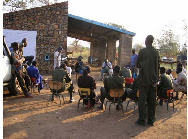
Figure 3 Beth Israel on the Nile

When we prayerfully planted this congregation in the wilderness back in 2005, we believed God would use the day of small beginnings to eventually bless and transform the entire country one day for His glory. This vision began to take hold in 2007, as we watched the church grow from 50 dedicated believers to over 400, whose lives will never be the same because of saving power of Jesus Christ! The strongholds of alcoholism, depression, and polygamy are tumbling down, as church leaders faithfully minister from house to house, applying the word of God to diverse life issues.