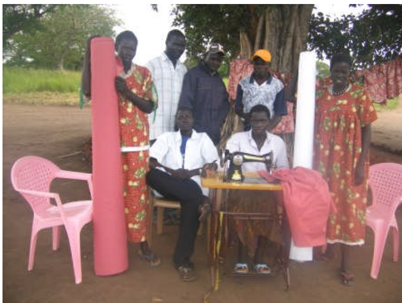
Figure 5 the trainer and the trainees

A generous donation from a church in California enabled us to equip this church run program with four new sewing machines in the spring of 2007. The machines are being used to train Christian widows to sew clothing and goods for their families and larger community, and prevent them from relying on the common practice of beer brewing for income. Last year 24 women received training in sewing and some have started their own sewing business.