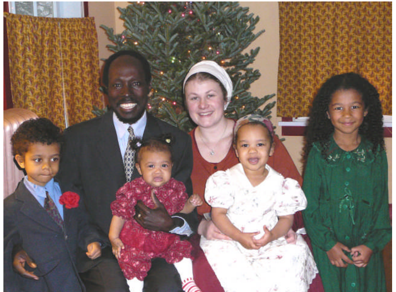
Figure 6 the Levites;